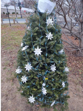
Remembrance Tree for the Homeless at Besse Park

This year for the first time Turning Point was able to obtain one of the Town of Wareham's Remembrance Trees in Besse Park. Tree #5 was dedicated to those individuals who died in the past year, either unsheltered or as a result of having been unsheltered at some time (life expectancy for unsheltered individuals is 48 years of age).